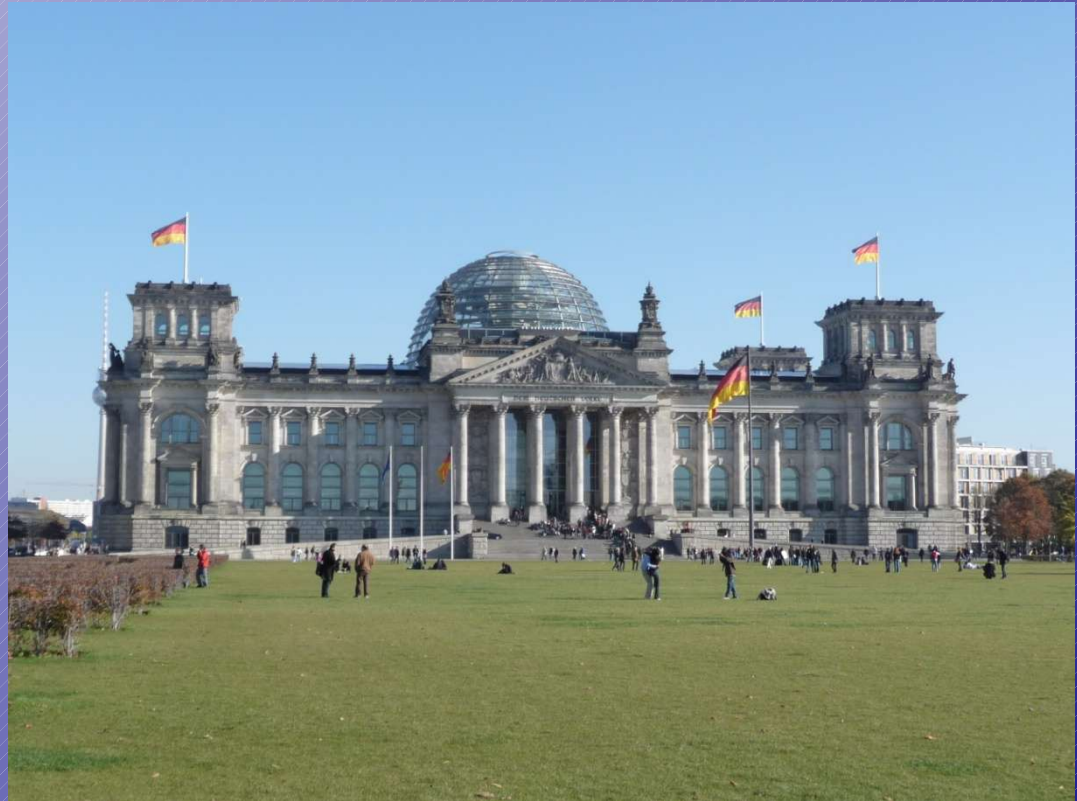
The Reichstag in Berlin houses the German Parliament (Bundestag)